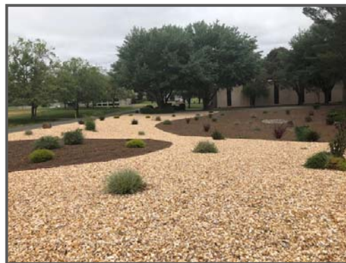
New xeriscape outside Lower Galley, TRACEN Petaluma (Two Rock)

once the employees were finally able to return to their sites, but they have been working diligently